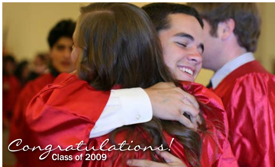
A heartfelt congratulations goes to the Class of 2009! The entire faculty and staff congratulate you on your accomplishment and wish you the very best future. Photo from the Baccalaureate Mass held in June.